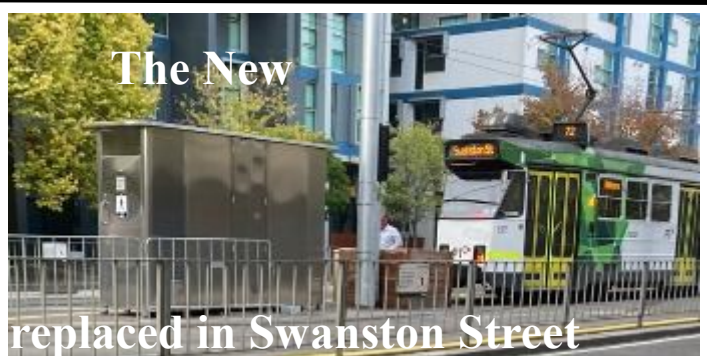
Tramways toilet finally replaced in Swanston Street