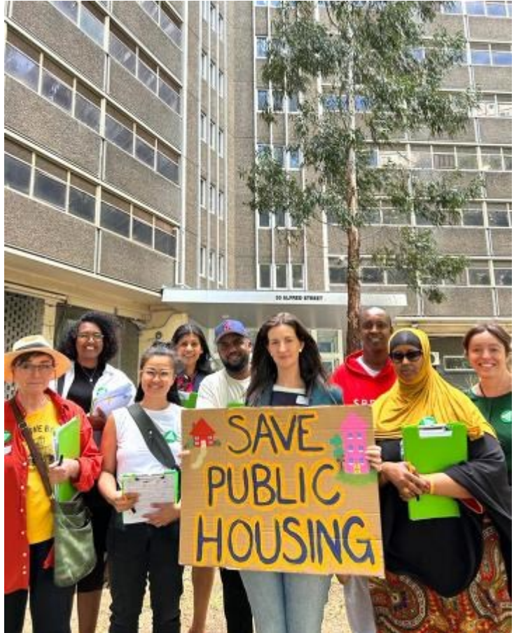
Ellen with local public housing residents

If you'd like to join the campaign to save public housing, get in touch at: office@ellensandell.com