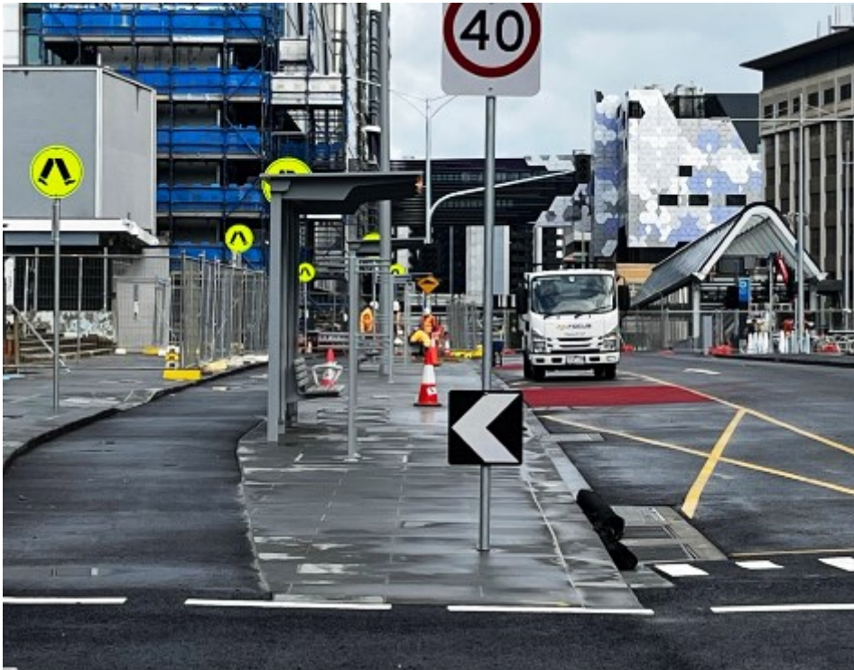
On the left, a section of these works with the new station entry on the right, a bus stop and bike lane.

Work from Royal Parade to Bouverie Street, south of the University of Melbourne campus, which includes the new rail station entrances is also well advanced including hard landscaping, seats, bus stops and bike paths.