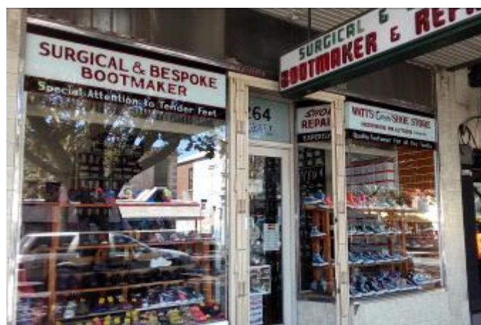
Watt's Corner Shoe Store

Generations of people return for the sense of continuity provided by Watts’ displays and interiors.