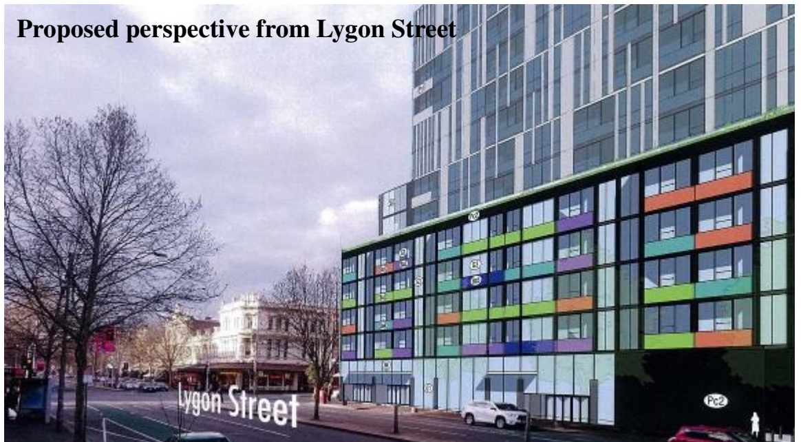
Proposed perspective from Lygon Street