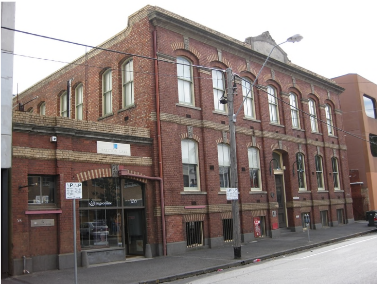
96 – 106 Pelham Street, Carlton [to the west of the subject site]

This new development, on the opposite corner, is not a relevant precedent for the current development proposal; it is not adjacent to significant heritage assets.