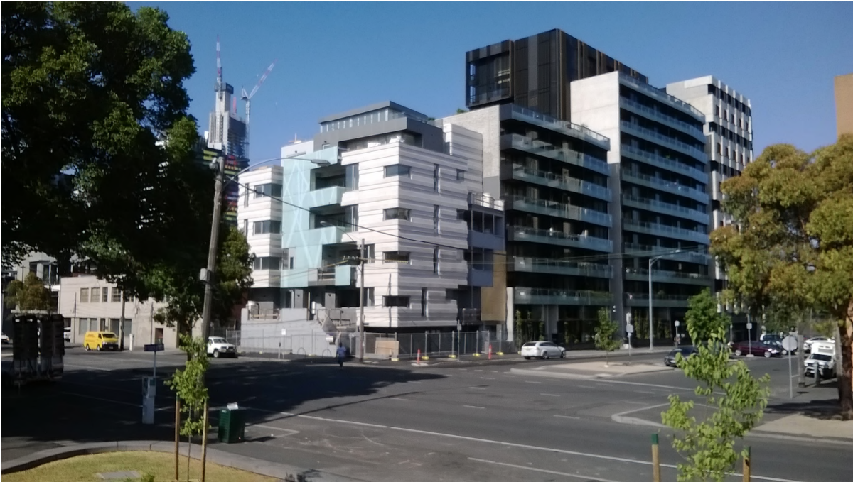
159 – 167 Cardigan Street, Carlton

This new development, on the opposite corner, is not a relevant precedent for the current development proposal; it is not adjacent to significant heritage assets.